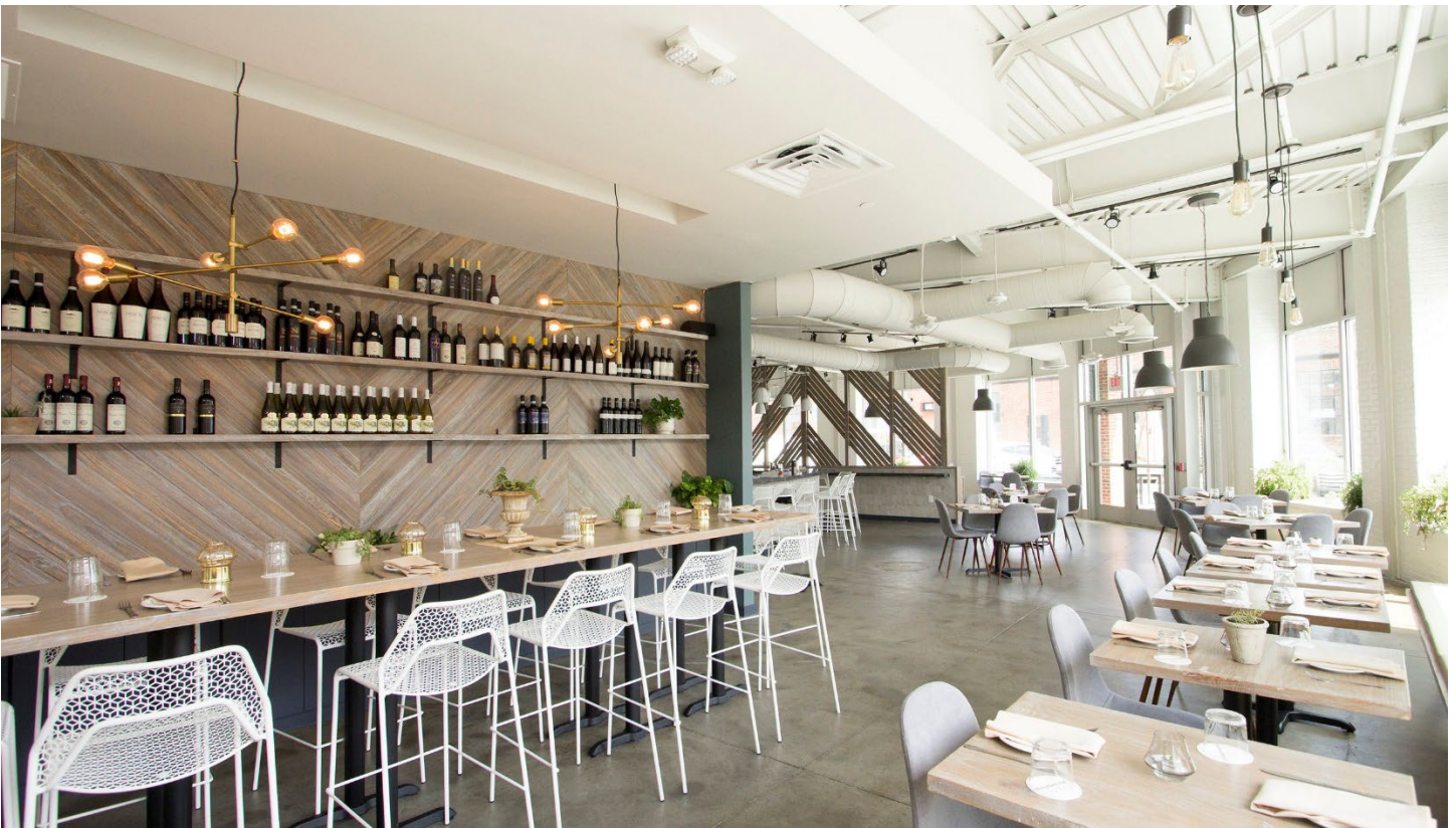
Dinner at Brenner Pass